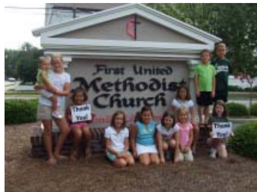
WWJD Wednesday — The children baked cookies and delivered them to the Conway Police Department, CAP, the Church office, and the Water Department to thank them for their work in the city of Conway.