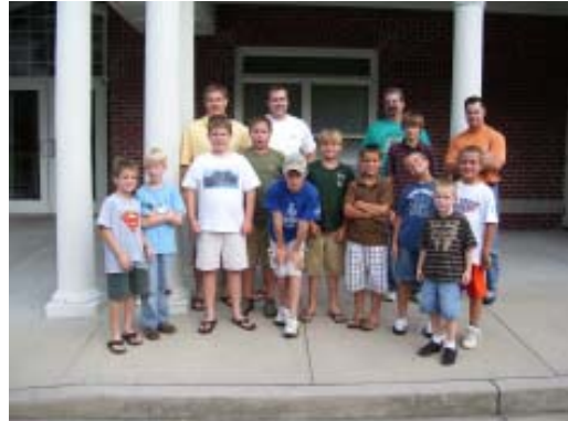
Elementary school boys group first outing on June 26 to Surf's Up Family Fun Center.